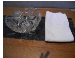
Washing bowl & Towel