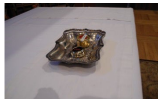
Tray with pixes