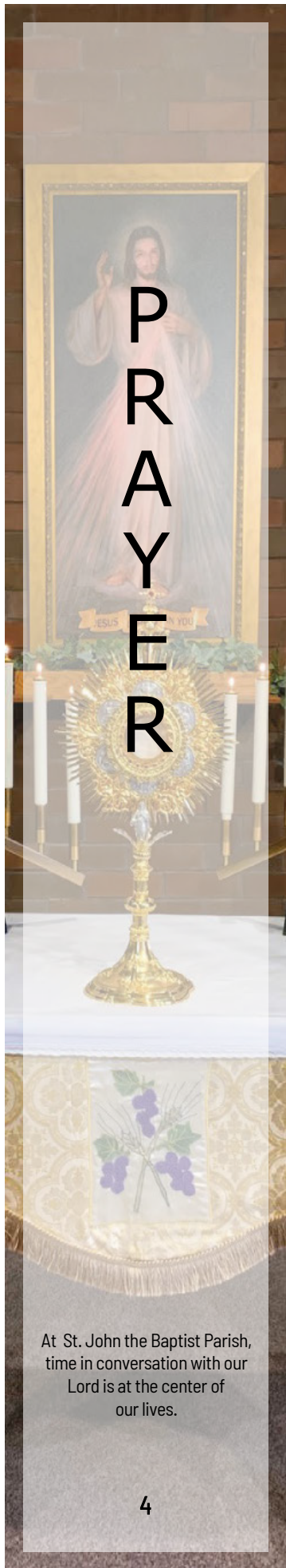
At St. John the Baptist Parish, time in conversation with our Lord is at the center of our lives.